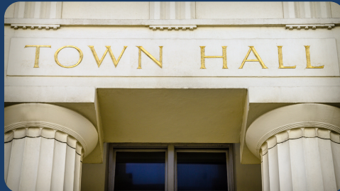
Community Town Halls