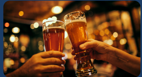
Cheers and Chats